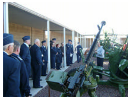
Chaplains were given a special tour during their stay at Nellis AFB.