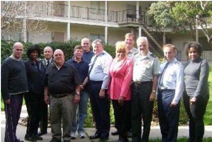
First Chaplains Training Class—March 2007