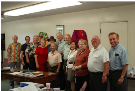
Second Chaplains Training Class—May 2007